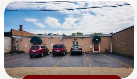
REAR OF BLDG